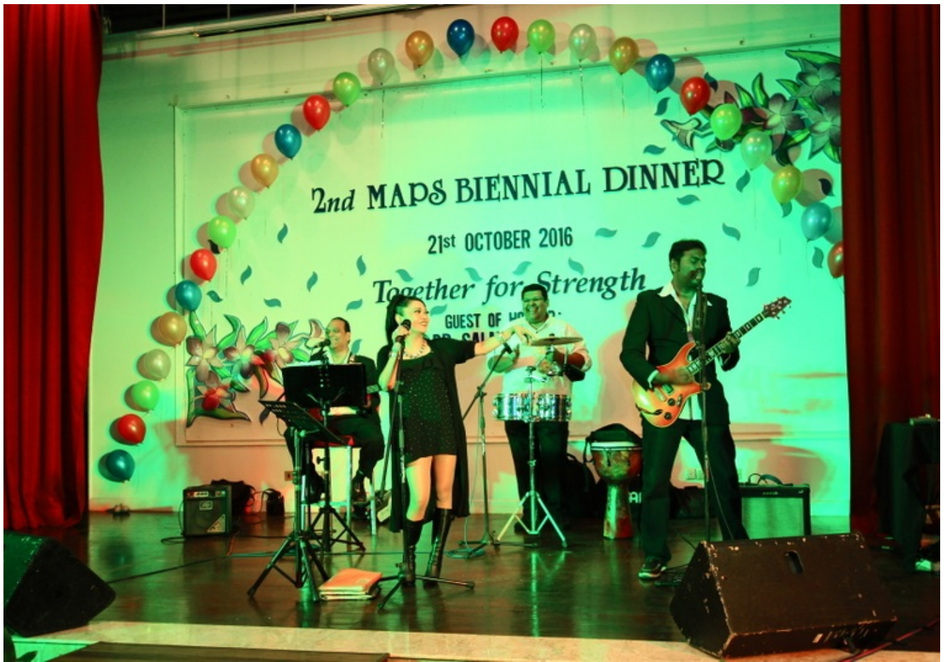
The night also saw the audience waiting in anticipation of the many lucky draws.