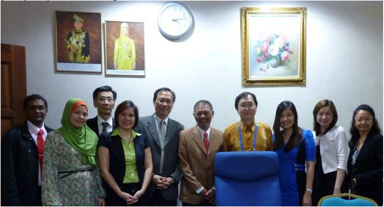
(Below)Participants in the meeting

Content on this site is copyrighted to the Malaysian Association of Pharmaceutical Suppliers.